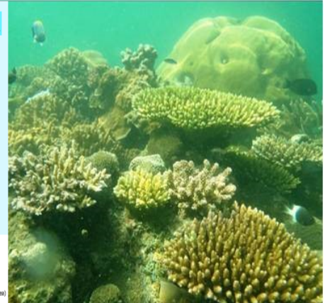
Donnor site with healthy coral