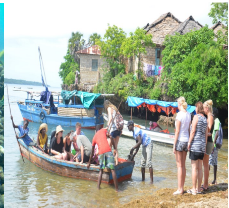
Youth engagement and job creation, Increased fish catch, improved marine ecosystem and livelihood activities such as tourism