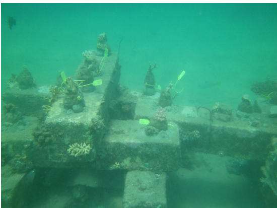
CDA artificially restored site in 2019