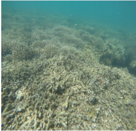
Degraded coral reef site

The innovation involves artificial transplantation, tagging, and tracking of coral reefs