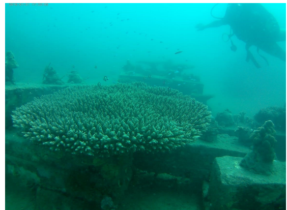
CDA's artificially restored site in 2021