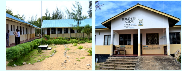
Ngomeni Secondary School