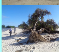
MASSIVE SHORELINE EROSION & DEGRADATION